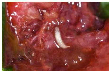
SWD larva (maggot) inside fruit.

SWD was found in Asia and Europe in the 1900s. It was first noted in North America in 2008, on strawberries and caneberries in California. By May 2009, the fly was causing economic-level damage to cherries in various parts of California. SWD is now established in the Pacific Northwest. As of mid-July 2010, it has been confirmed in all Western Washington counties and at least four counties in Eastern Washington.