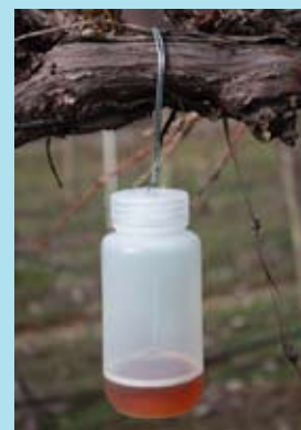
Nalgene bottle trap in Concord vineyard.

Pour an inch or two of real (not flavored) apple cider vinegar in the bottom of each trap. If you are not using the yellow sticky cards, you can add a few drops of liquid dishwashing soap, which acts as a surfactant to reduce surface tension on the vinegar and help flies sink. If you use the sticky cards, hang one in each trap or arch it loosely at the top of the trap.