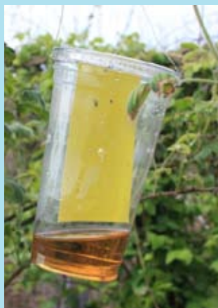
Trap with optional yellow sticky card inside.