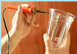
Burning holes in a plastic cup.

Commercial fly traps, available at hardware/nursery supply stores, can be used to monitor for SWD presence, or you can make traps. The main objective is to attract SWD and trap them for identification in some sort of container that excludes most other insects. Traps can be made with the following materials: